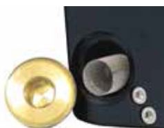
Integrated strainer to protect the valve