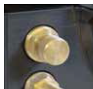
TEST button feature for routine testing.