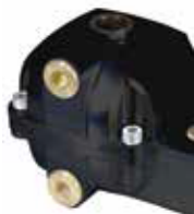
Three inlet options for easy installation.