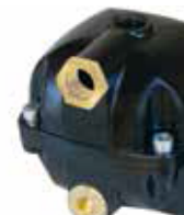
Sight port optionally available.